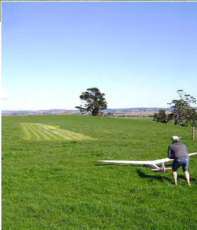
Top: Stuart with Greenley Tug.