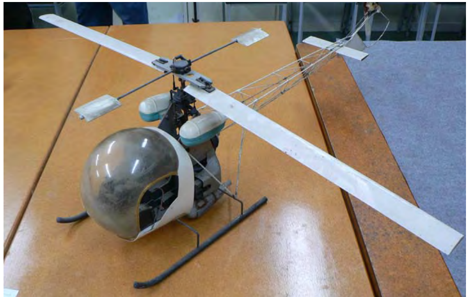
Top: Keith Trillo's new Glowworm. Insets show access to battery and receiver and provision for cooling.