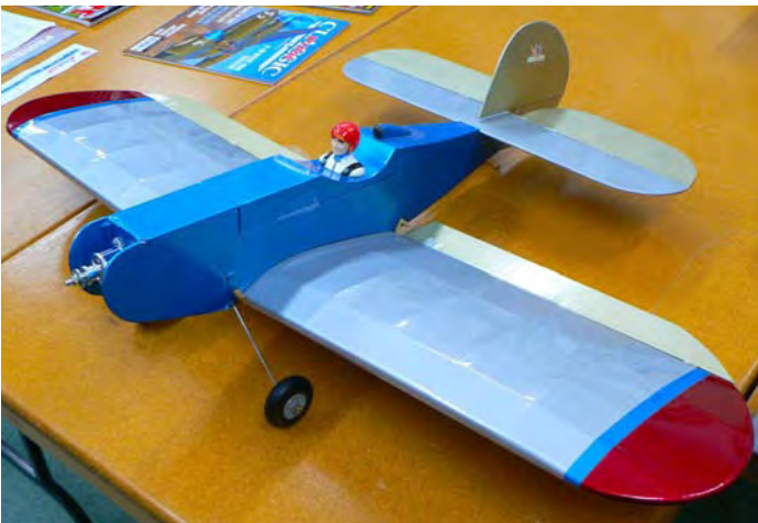
Top: Louis McNair has now completed this vintage Modelair Kingfisher. The tissue lettering is expertly handled.