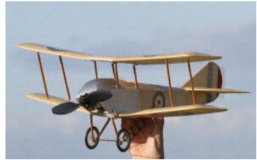
Electric power is perfect for those intricate Scale jobs: nice build, Bernie!

I hold strongly to the view that if I can do it, anybody can. It's actually easier than diesel power: straight out of the car and into the air. Of course, we won't ever rhapsodise about Great Electric Motors I Have Known, nor will they ever have the character that causes us to ascribe names to long-serving diesels (I have, for example, Lugless Douglas, Miss Edie Hunter and The Pawbreaker,) but just think about the simplicity of maintenance: shelve an electric motor for a couple of years and it will spin again like a good 'un at the touch of a pair of wires.