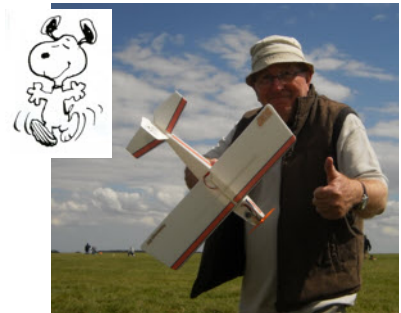
What? He beat us with that! Pah!